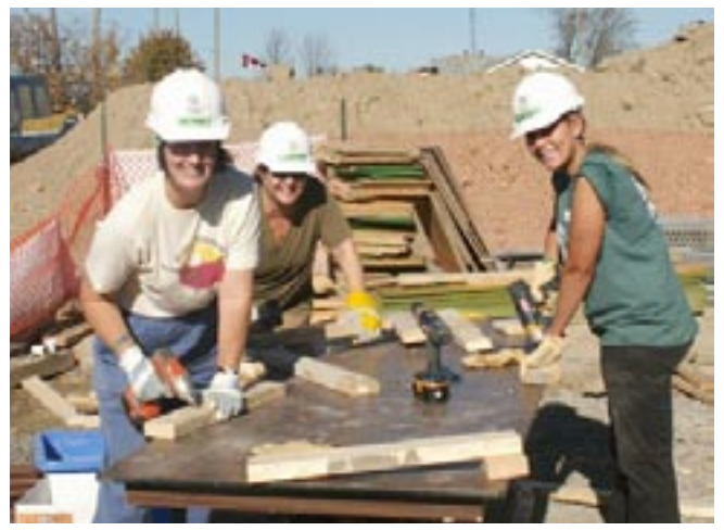
Habitat for Humanity: Elliott House Restoration