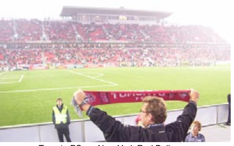
Toronto FC vs. New York Red Bulls