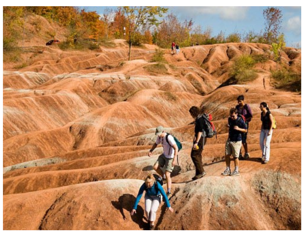
Cheltenham Badlands Hike