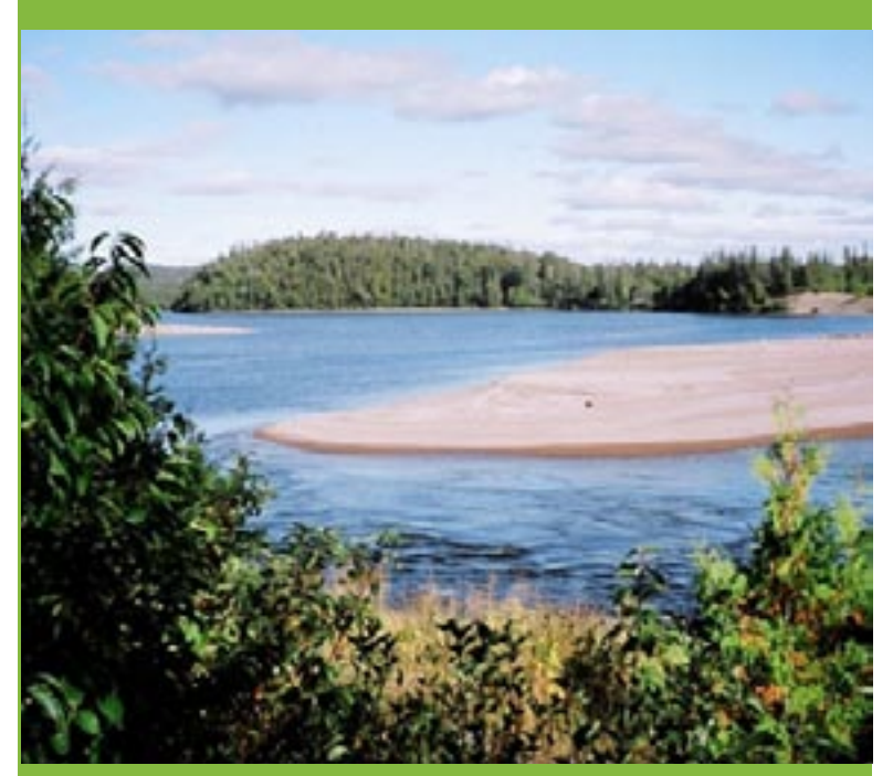
The mouth of the Michipicoten River and Driftwood Beach Provincial Park taken at Naturally Superior Adventures.

(Note from the outgoing president - continued from page 1)